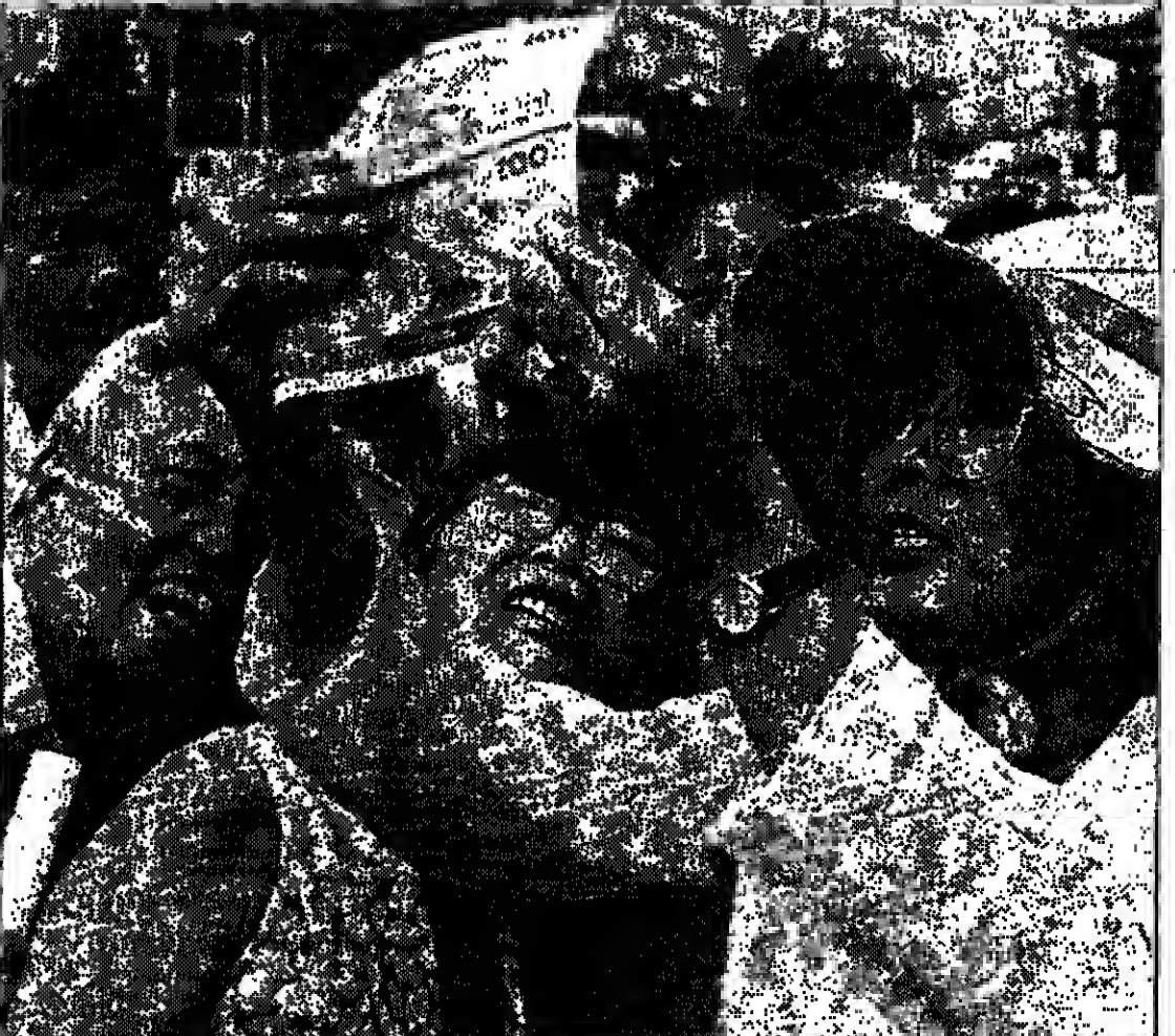
A bank employee shows passersby how to identify counterfeit money yesterday outside her bank in Beijing. In 1995, Chinese police confiscated $12 million in counterfeit bills.

In December, 85 Israeli firms are expected to show their goods during an exhibition in Oman, and a delegation of businessmen is expected to visit under the auspices of Industry and Trade Minister Nathan Sharansky, Propper said.